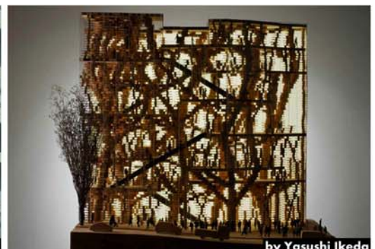
by Yasushi Ikeda