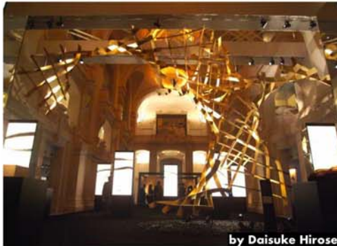
by Daisuke Hirose

Italian Institute of Culture in Tokyo 2-1-30 Kudan Minami, Chiyoda-ku, Tokyo 102-0074 http://www.iictokyo.esteri.it/IIC_Tokyo/ Symposium: Auditorium Umberto Agnelli B2F, friday February 24th, 16:00 - 18:45 Exhibition: exhibition hall 1F, from friday February 24th, 12:00 to sunday February 26th, 13:00 Language: Japanese and Italian with simultaneous translation